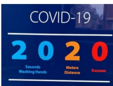
Signage to promote hygiene and social distancing measures