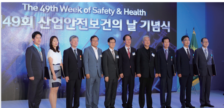
OSH Week Commemorative Ceremony 2