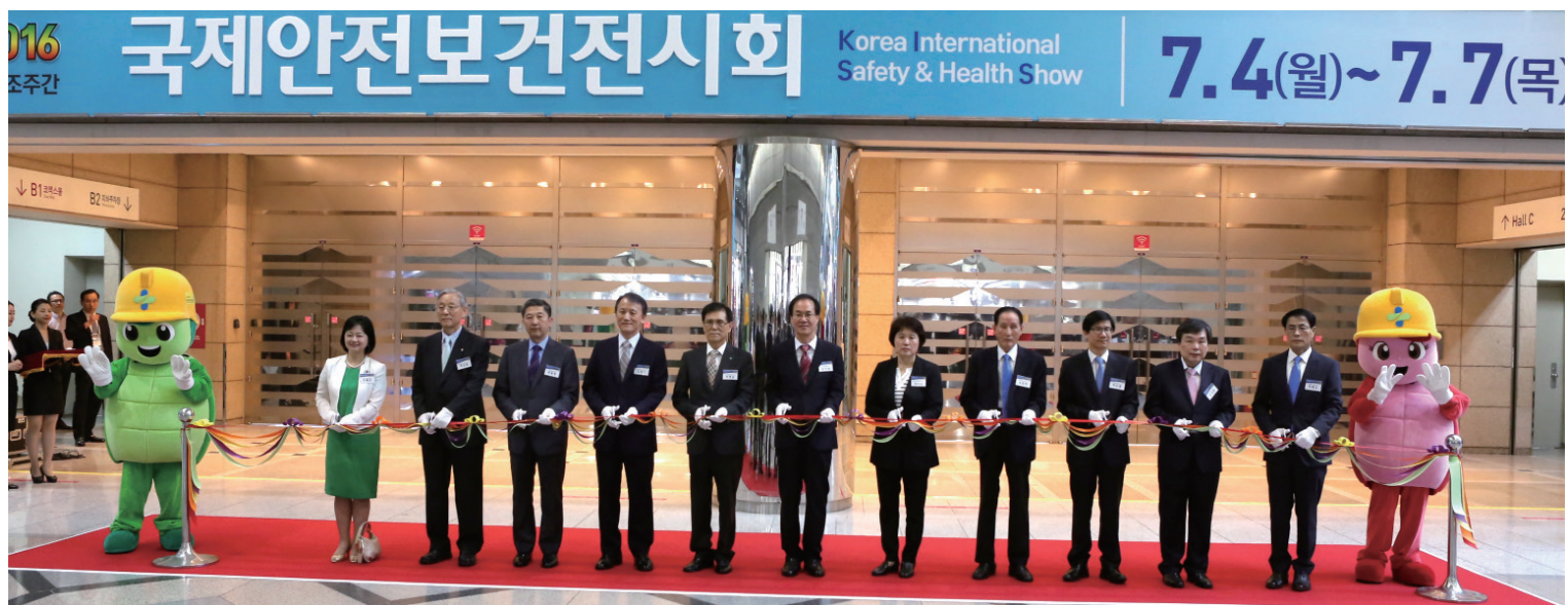
Ribbon Cutting Ceremony for KISS

The 49th Occupational Safety and Health Week was held by the Ministry of Employment and Labor of Korea (MOEL) and Korea Occupational Safety and Health Agency (KOSHA) from July 4th to 8th at Coex. This 5-day event was hosted in a very timely manner as the public interest in workers' safety and health protection has picked up due to recent industrial accidents.