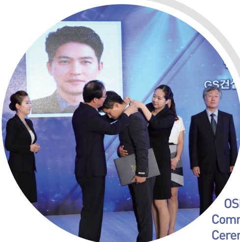
OSH Week Commemorative Ceremony 1