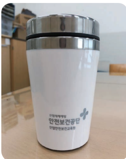
Photo of Tumbler