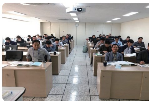
A person using a tumbler