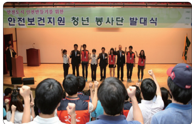
President Baek delivers the name tag to one of the members of the 'Youth OSH-protecting group'