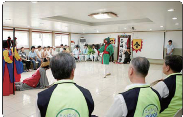
President Baek and volunteers of KOSHA are enjoying the Song-pa mask dance with inmates of the shelter.