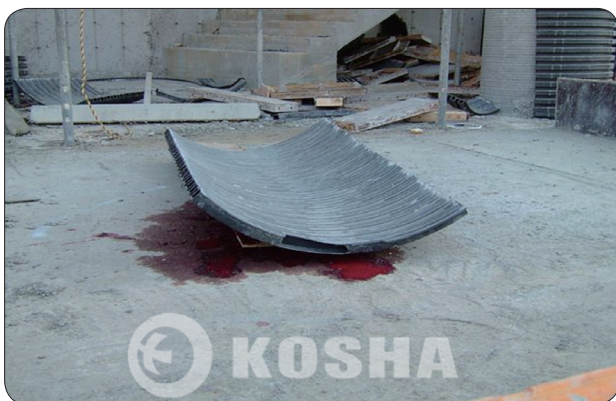
- Victim's Crash Site -