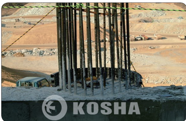
- RC Column connected with the Steel Frame -