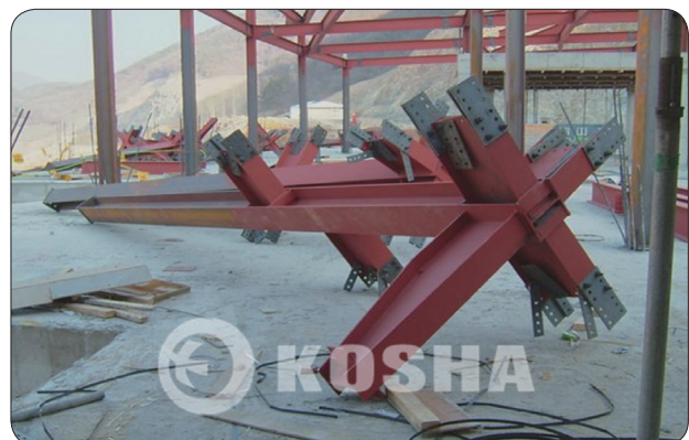
- Transported Steel Column -